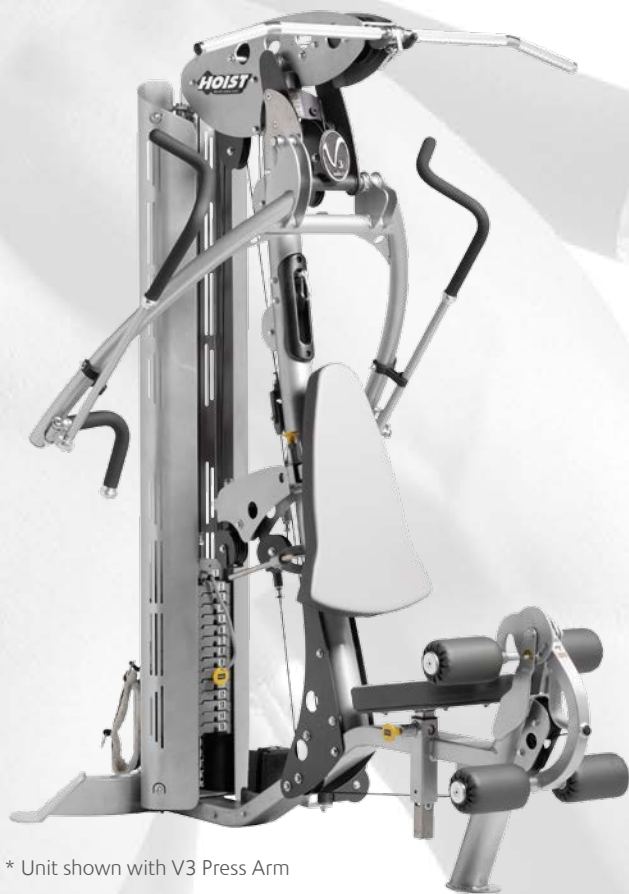
* Unit shown with V3 Press Arm