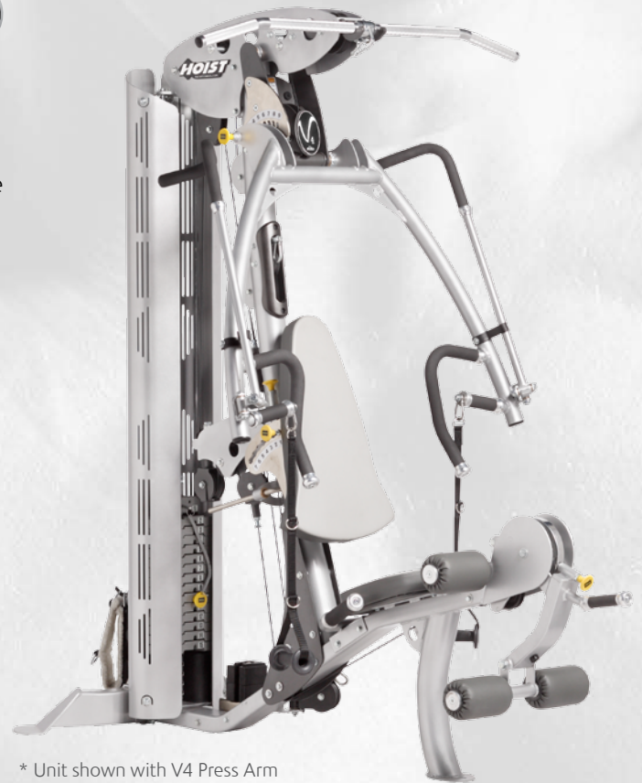
* Unit shown with V4 Press Arm