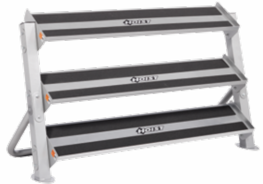
SHOWN WITH OPTIONAL 60" 3RD-TIFR (HF-4461-OPT-60)