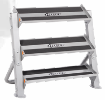
SHOWN WITH OPTIONAL 36" 3RD-TIER (HF-4461-OPT-36).