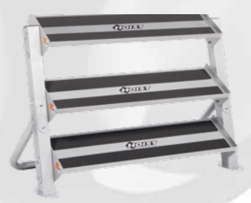
SHOWN WITH OPTIONAL 48" 3RD-TIER (HF-4461-OPT-48).